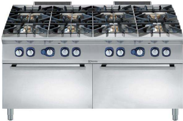
391017 (E9GCGP8CG0) 8-Burner (2x10 kW, 6x6 kW) gas Range on 2 gas Oven (8,5 kW each)