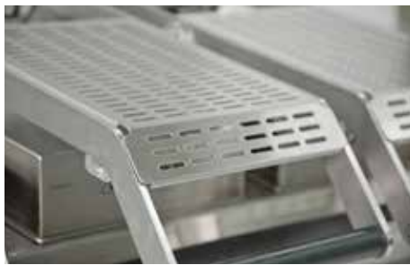
Protective heat shield and rigid handle