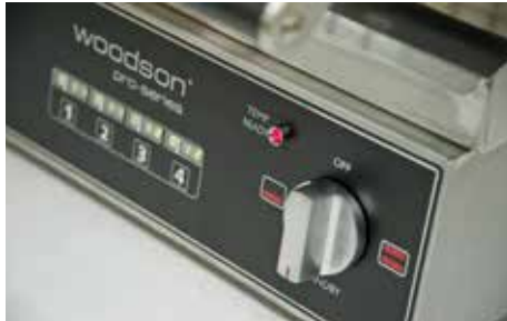
New energy saving plate selection control

Used in quick service restaurants around the globe, these are the true professionals' choice.