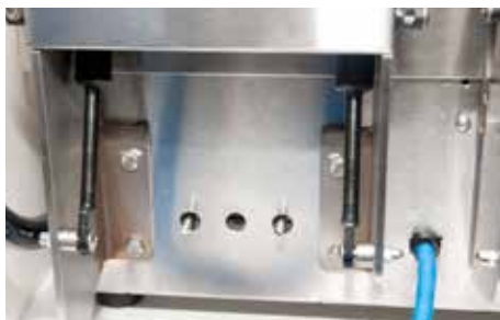
Twin thermostat controls on rear of unit