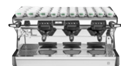
CLASSE 7 USB TALL 3 GROUP