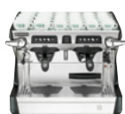
CLASSE 5 USB TALL 2 GROUP COMPACT