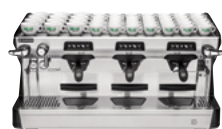
CLASSE 5 USB TALL 3 GROUP