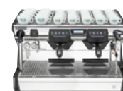
CLASSE 7 USB TALL 2 GROUP ISTEAM