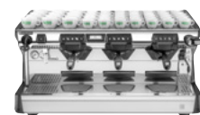
CLASSE 7 USB TALL 3 GROUP iSTEAM