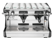
CLASSE 5 USB TALL 2 GROUP