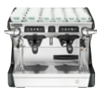
CLASSE 5 USB TALL 2 GROUP COMPACT