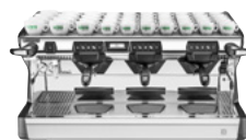
CLASSE 7 USB TALL 3 GROUP