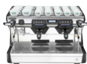
CLASSE 7 USB TALL 2 GROUP