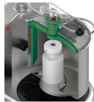
Scraper spatula for cleaning the tank and lid during processing