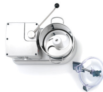
Variotronic: stabilised speed variator