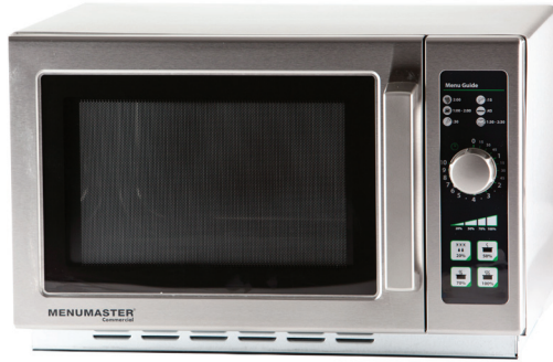
Model RCS511DSE shown